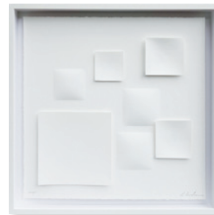
RALPH KERSTNER PERPLEX, 2018